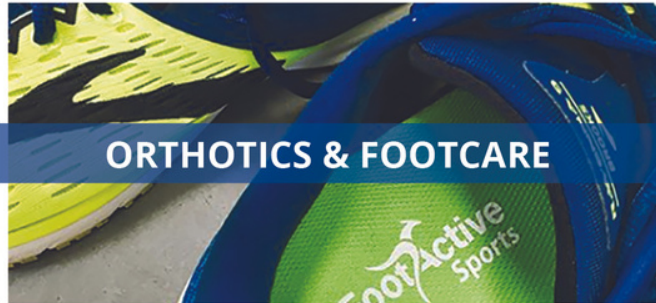
ORTHOTICS & FOOTCARE