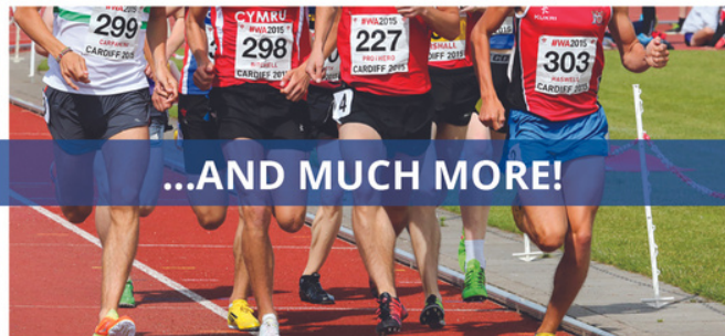
...AND MUCH MORE!