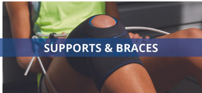
SUPPORTS & BRACES