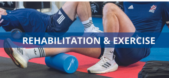
REHABILITATION & EXERCISE