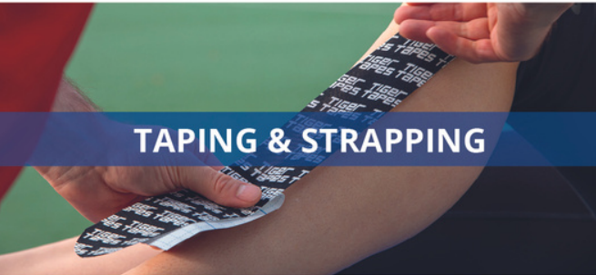
TAPING & STRAPPING

TRAIN AND COMPETE IN CONFIDENCE WITH THE RIGHT TOOLS TO HELP ENHANCE YOUR PERFORMANCE AND RECOVERY.